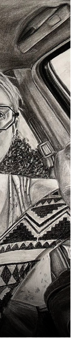
Sarah Watson: "Home", 2024, charcoal on BFK Rives, 3' x 4'