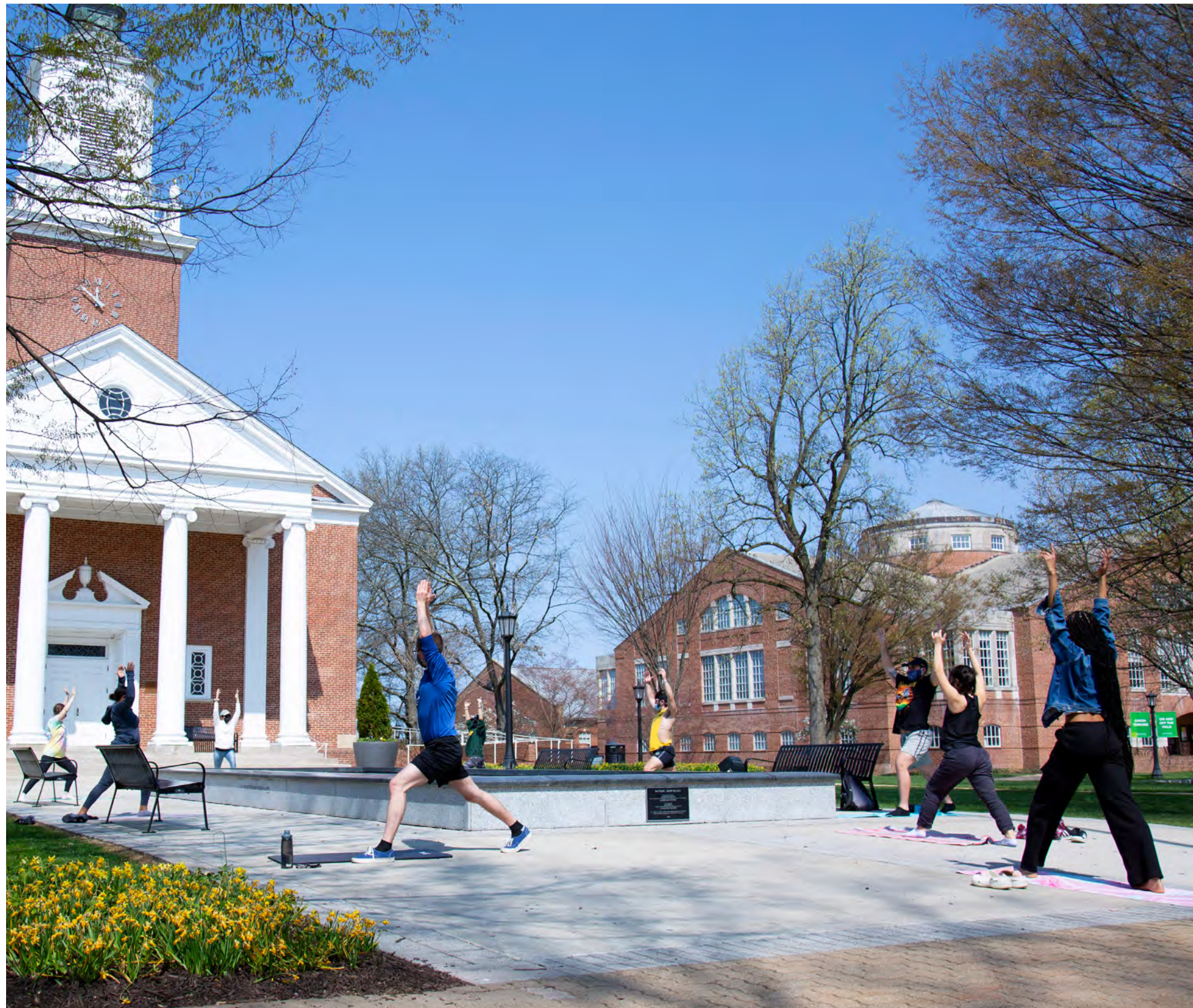
Yoga at McTeer-Zepp Plaza Fountain.