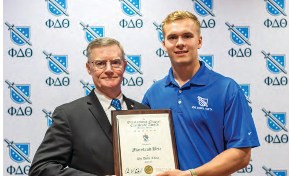
PHI DELTA THETA