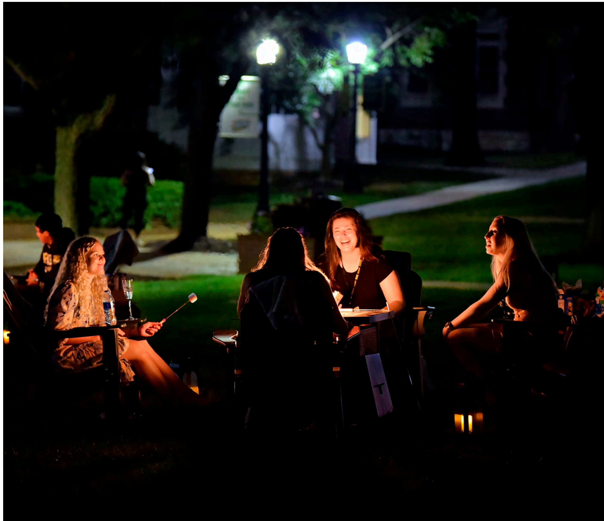
After the Alumni Association Awards Banquet and Green Terror Sports Hall of Fame induction ceremony on Friday, Oct. 15, guests were invited to enjoy s'mores and a champagne toast to continue the celebrations.