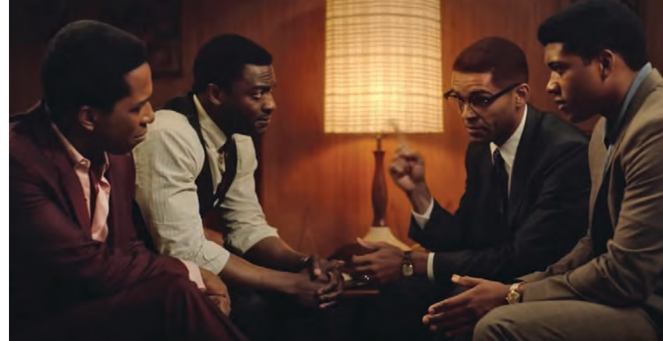
"One Night in Miami," Black American Film Festival on Dec. 2

Sun., 3 p.m. WMC Alumni Hall Information: 410-857-2599