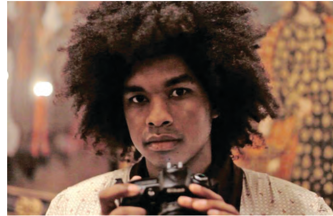
"An Oversimplification of Her Beauty," Black American Film Festival on Sept. 9