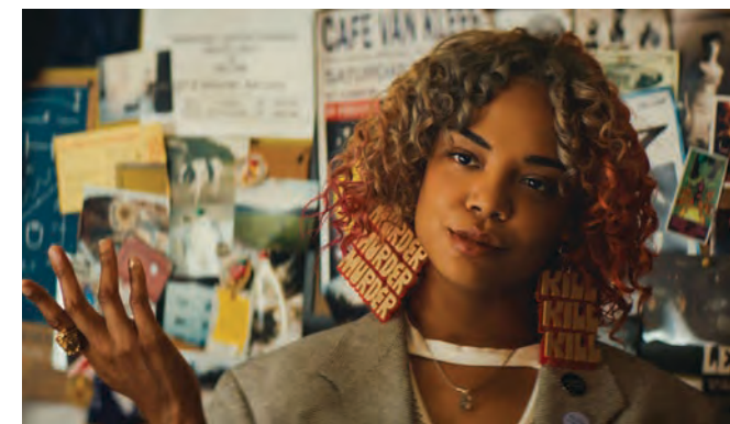
"Sorry to Bother You," Black American Film Festival on Oct. 7

Thurs., 7 p.m. Naganna Forum, Roj Student Center Information: odei@mcdaniel.edu or 410-857-2459