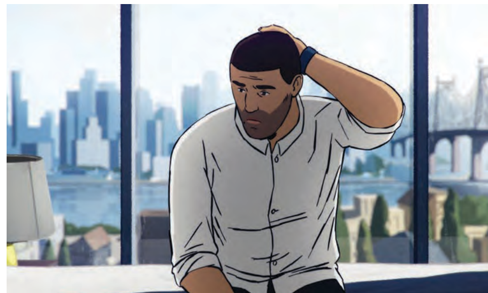
"Flee," World Wise Documentary Film Series on Nov. 8

Fri., 7 p.m. Coley Rice Lounge, McDaniel Hall Information: 410-857-2599