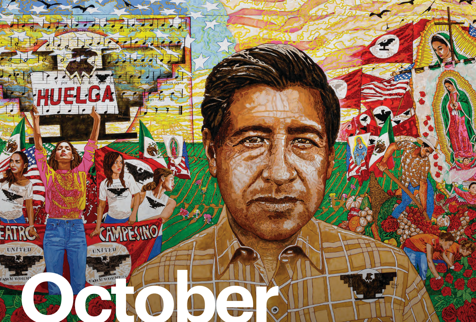
"A Song for Cesar," Cultural Speaker Series on Oct. 6