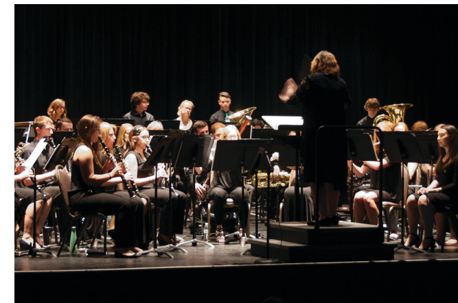
Westminster Symphony Orchestra

Gill Center Information: mcdaniel.edu/commencement