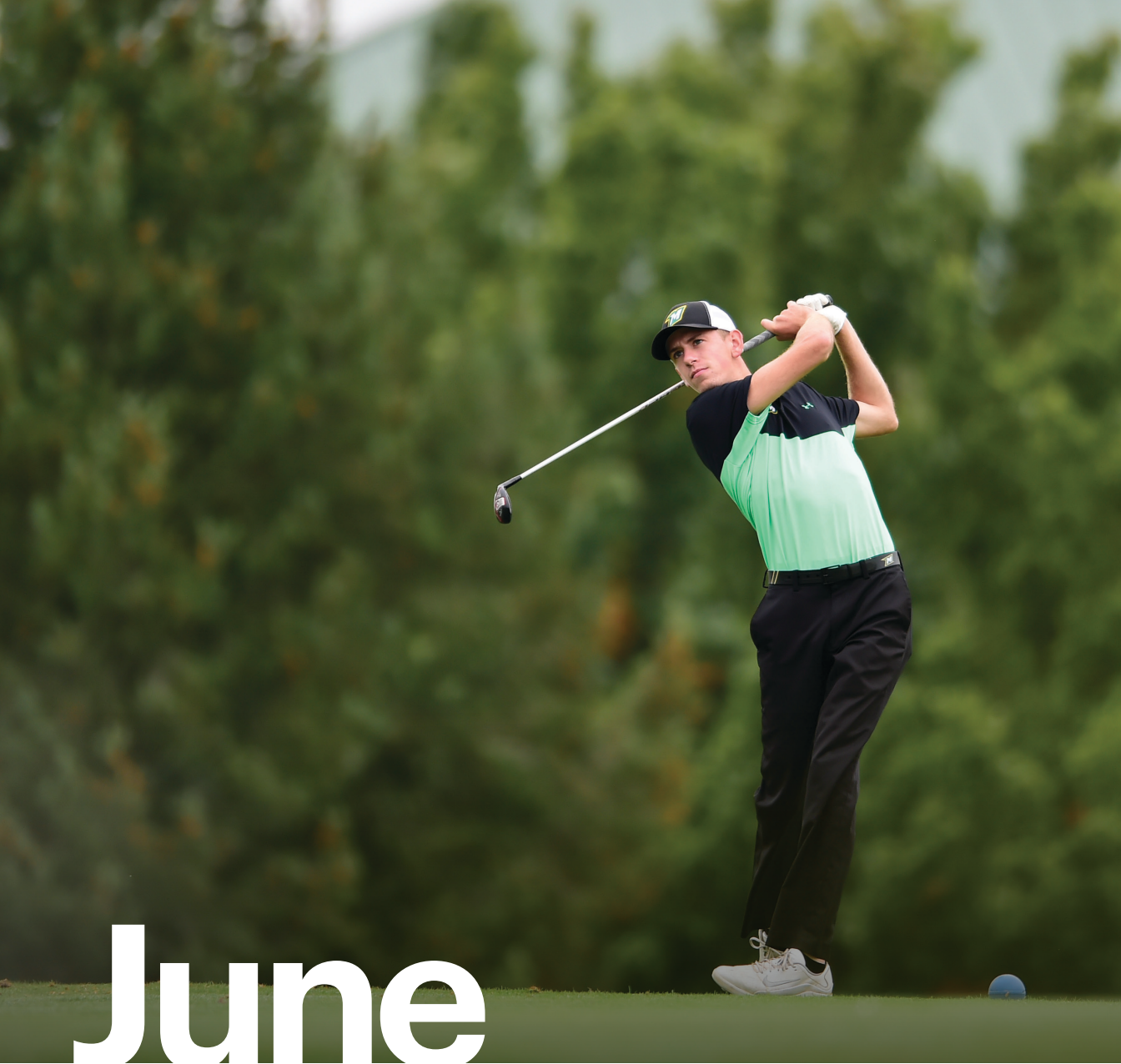
Green and Gold Golf Classic on June 5