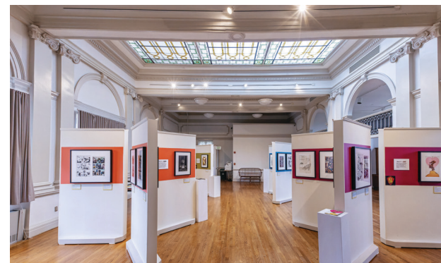
Esther Prangley Rice Gallery

*indicates a fee, otherwise all published events are free and open to the public