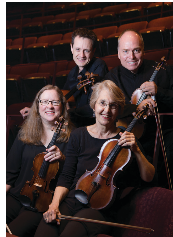
The Left Bank Quartet performs March 12

*indicates a fee, otherwise all published events are free and open to the public