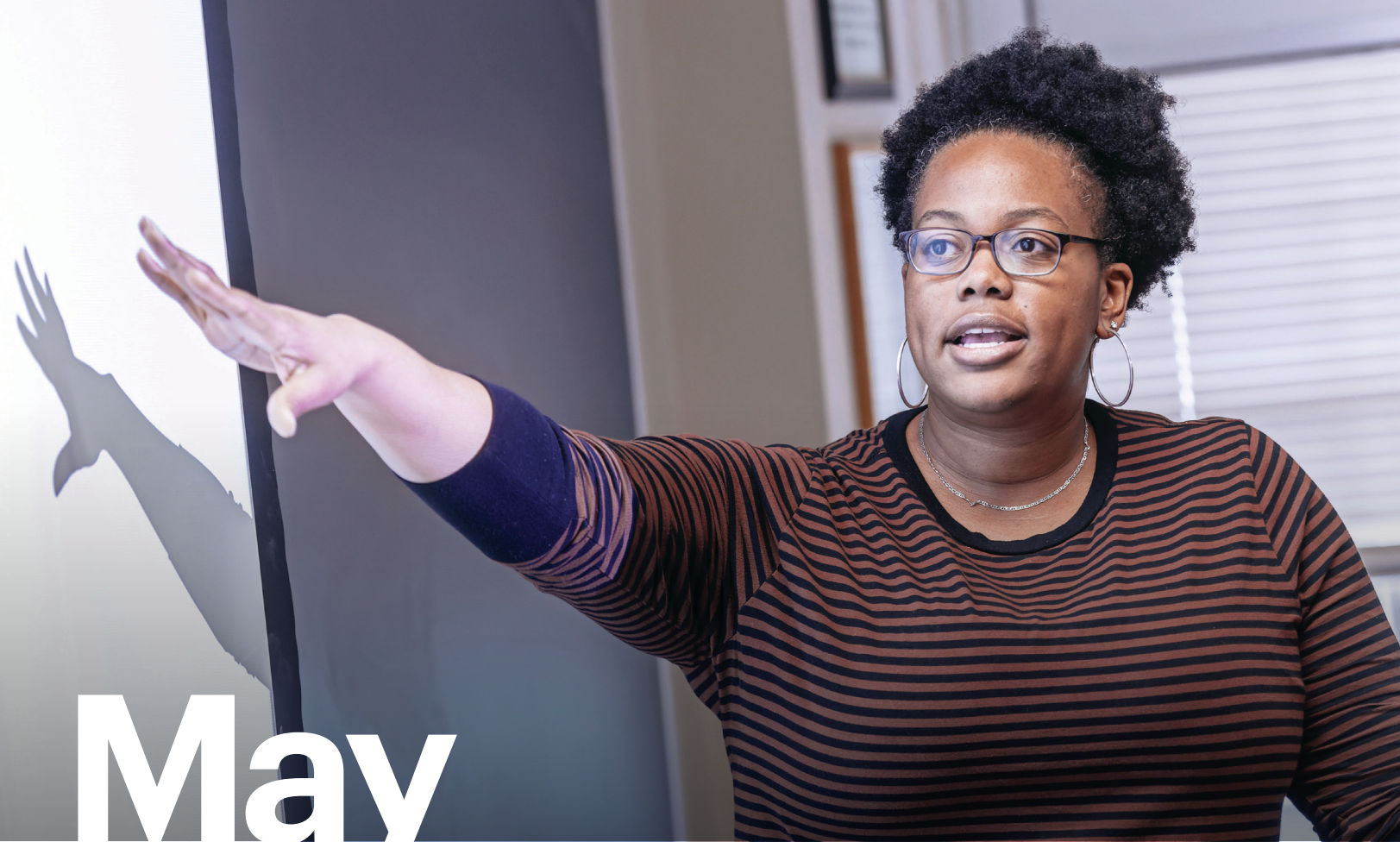
McDaniel's second annual Academic Symposium on May 1