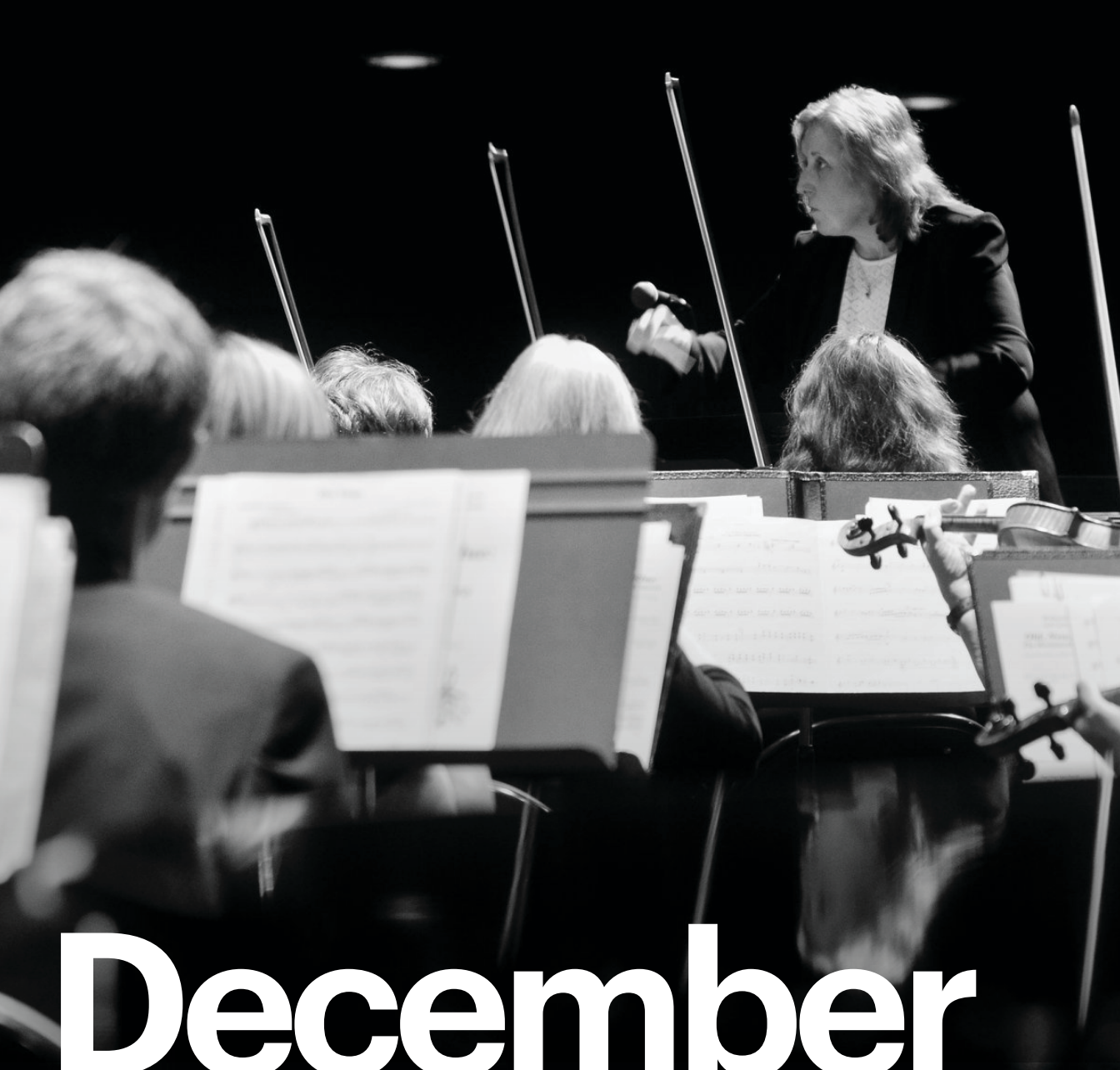
Westminster Symphony Orchestra