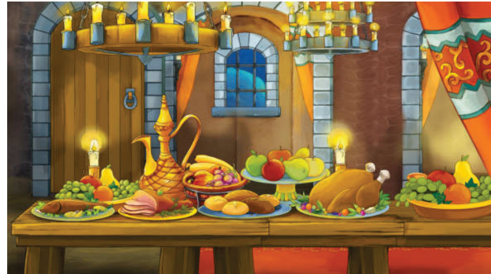
Dirty Beefeaters Ball

Fri., 6 p.m. Naganna Forum, Roj Student Center Information: 410-857-2599 or kyengler@mcdaniel.edu