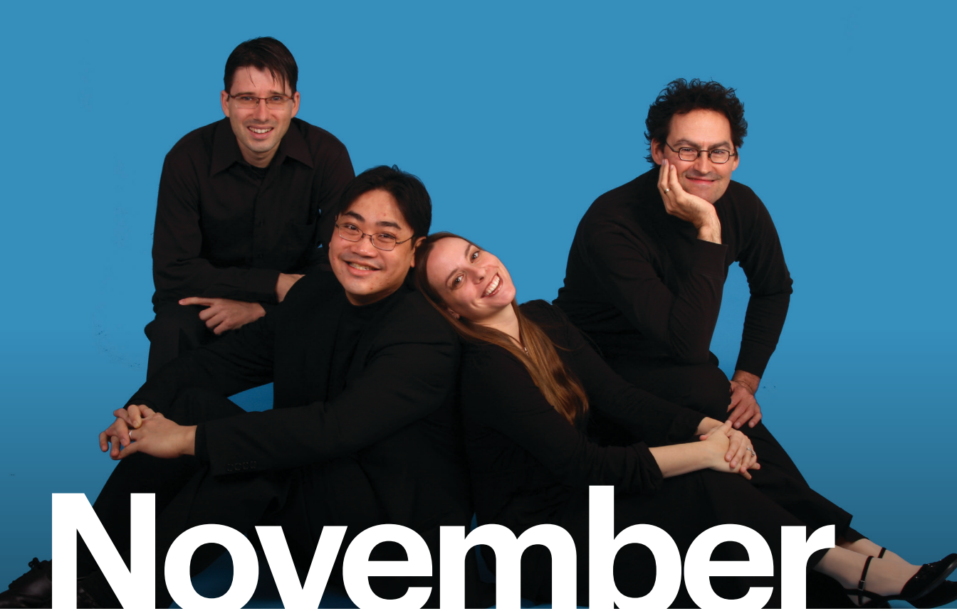
Azimuth String Quartet