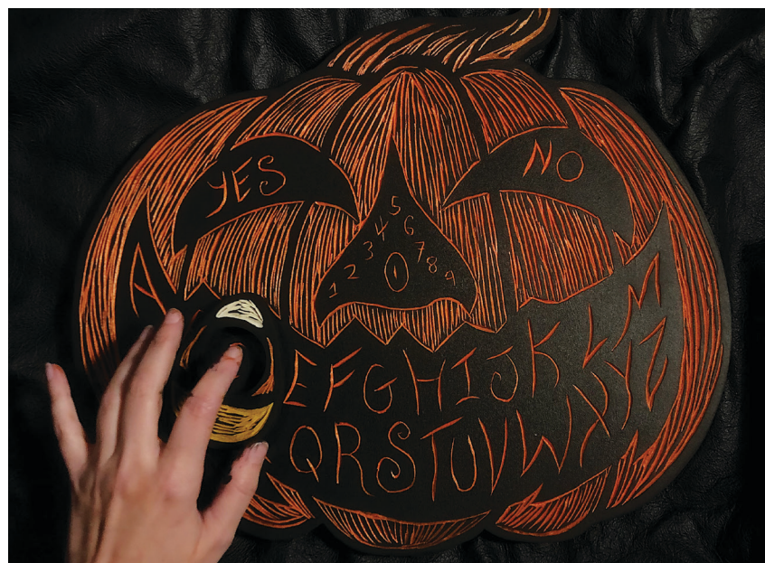
"All Hallow's Board," a set of two wood carvings finished with acrylic paint and polyurethane, by Jessi Hardesty